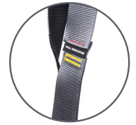
Rip stitch indicators