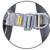
Front & rear attachment points